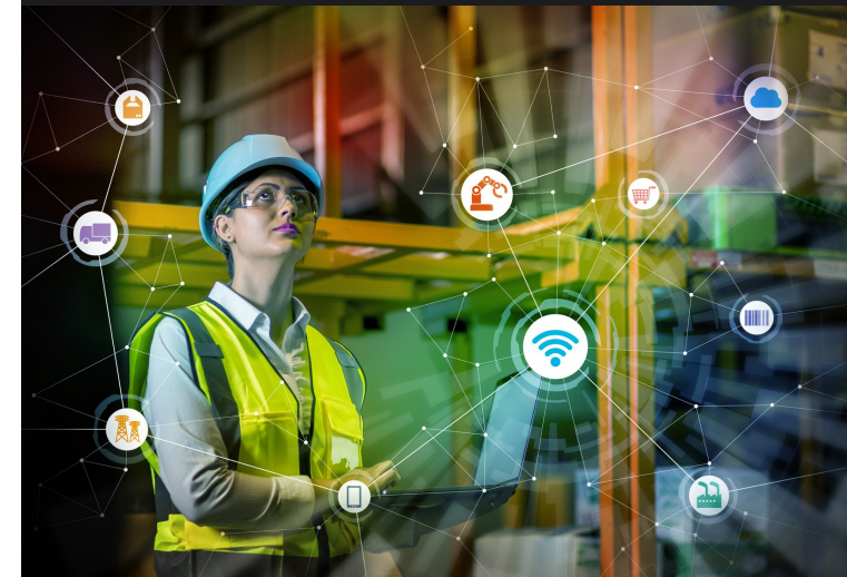
Asset Management solutions for warehouses.